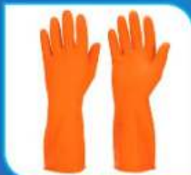
INDUSTRIAL RUBBER GLOVES