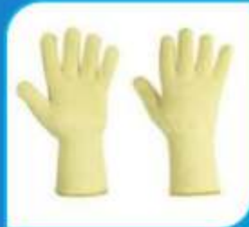
KEVLAR GLOVES (KNITTED)