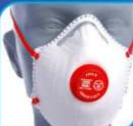
VENUS MASK V 90 FFP2