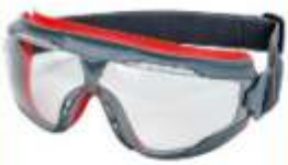
SAFETY GOGGLES 3M