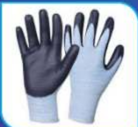
RUBY NITRILE GLOVES