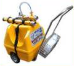
MOBILE FOAM TROLLEY