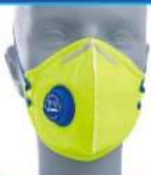
VENUS MASK V 410 FFP1