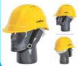
SAFETY HELMET (VENTILATION)