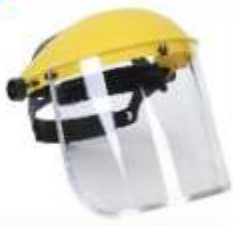
FACE SHIELD (RACHET TYPE)