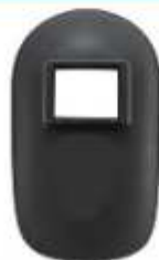
WELDING HAND SCREEN