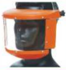
CLEAR STRETCHABLE FACE SHIELD