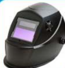
AUTO DARK HELMET (WELDING)