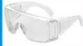
OVER SPACE GOGGLES