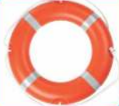
LIFE BUOY RING