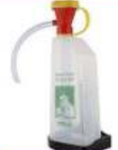
EYE WASH BOTTLE