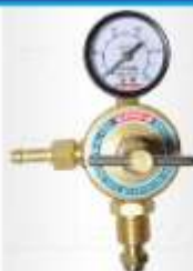
SINGLE METER REGULATOR