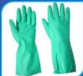
NITRILE RUBBER GLOVES