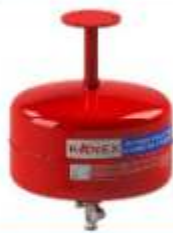
AUTOMATIC MODULAR FIRE EXTINGUISHER