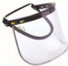
FACE SHIELD SPRING TYPE