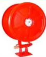
FIRE HOSE REEL SWINGING TYPE