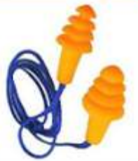
VENUS EAR PLUG