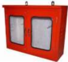
HOSE BOX (DOUBLE DOOR)