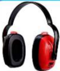
3M EAR MUFF