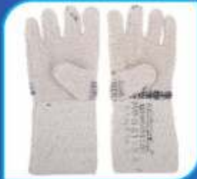
AST HAND GLOVES