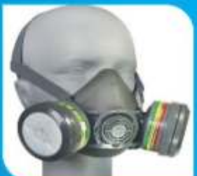
DOUBLE CARTRIDGE MASK