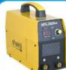
INVERTER WELDING MACHINE