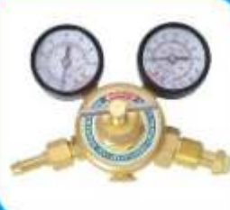
OXYGEN DOUBLE METER REGULATOR