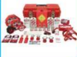
SAFETY LOCKOUT TAG OUT