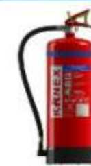
FIRE EXTINGUISHER ABC TYPE