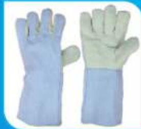
KEVLAR GLOVES (LEATHER)