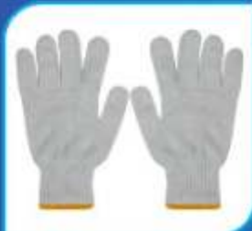
KNITTED GLOVES (WHITE)