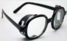
WELDING GOGGLES (WHITE)