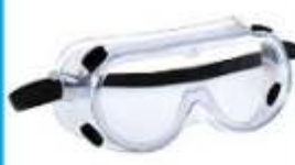
CHEMICAL SPLASH GOGGLES