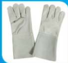
LEATHER GLOVES (WHITE)