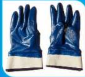
NITRILE DRIL CUFF