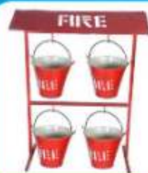
FIRE BUCKET & STAND