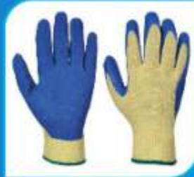
LATEX COATED GLOVES