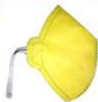
NON WOVEN MSAK