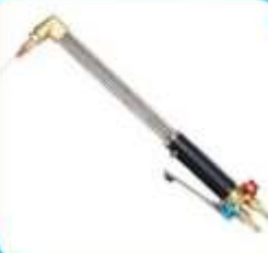
GAS WELDING TORCH