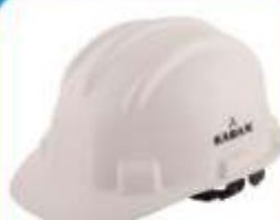
SAFETY HELMET (KARAM)