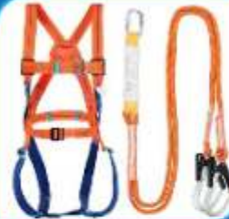
SAFETY BELT FULL BODY (UDYOGI)