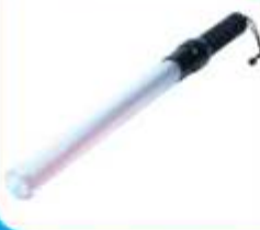
SAFETY LIGHT BAR