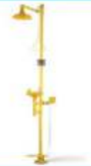
EYE WASH & SAFETY SHOWER