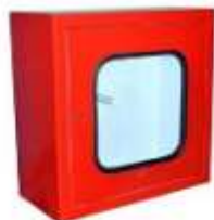
HOSE BOX (SINGLE DOOR)