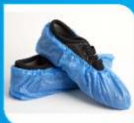
PVC SHOE COVER