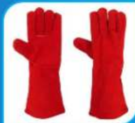
LEATHER GLOVES (RED)