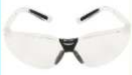
SAFETY GOGGLES 3M 11850