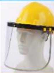
HELMET WITH FACE SHIELD