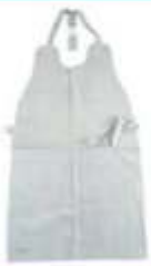
LEATHER APRON (WELDING)