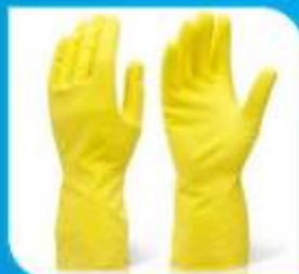
HOUSE HOLD RUBBER GLOVES