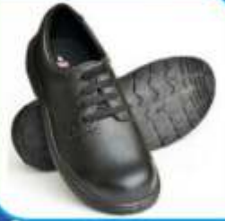
HILLSON U 4