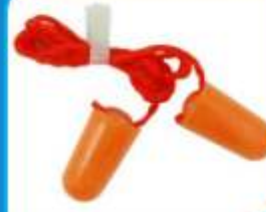
3M EAR PLUG