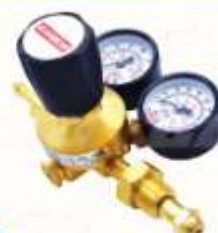
CO2, ARGON, DOUBLE METER REGULATOR