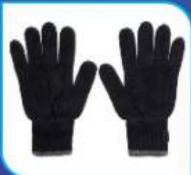
KNITTED GLOVES (BLUE)