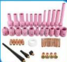
ARGON WELDING ACCESSORIES