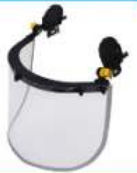
GRINDING FACE SHIELD