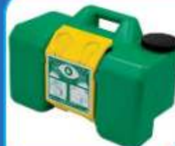
EYE WASH UNIT