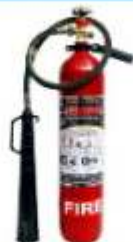
FIRE EXTINGUISHER CO2 TYPE