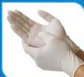
SURGICAL HAND GLOVES