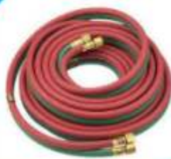
WELDING HOSE PIPE