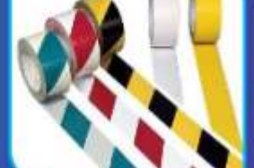
FLOOR MARKING TAPES